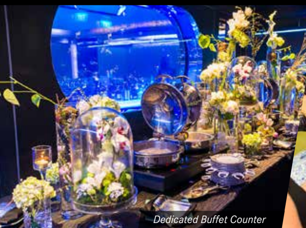
Dedicated Buffet Counter