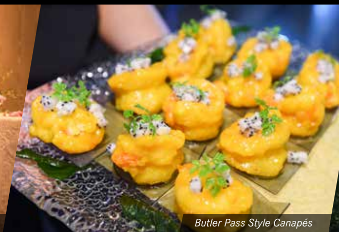
Butler Pass Style Canapés