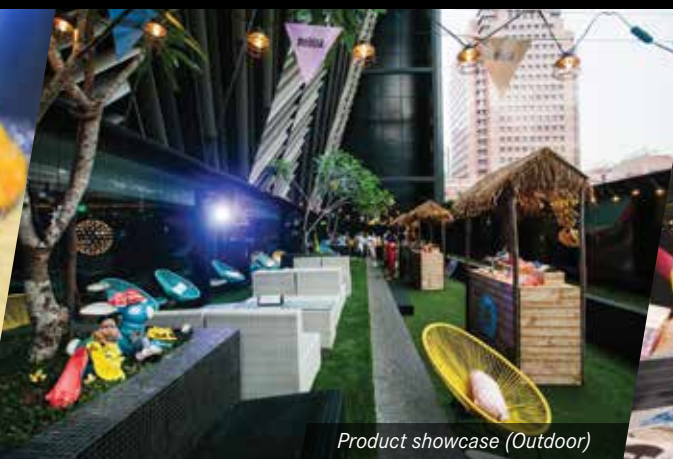
Product showcase (Outdoor)